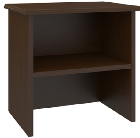
Model: MIBH 20.5W 11.75D 20H

Time-honored crafting and practical concerns blend to produce refined, functional furniture. OG edging and gently radiused corners add understated touches of distinction to these water- and scuff-resistant, fire-retardant products. Choose from dozens of hardware styles, including ADA-compliant.